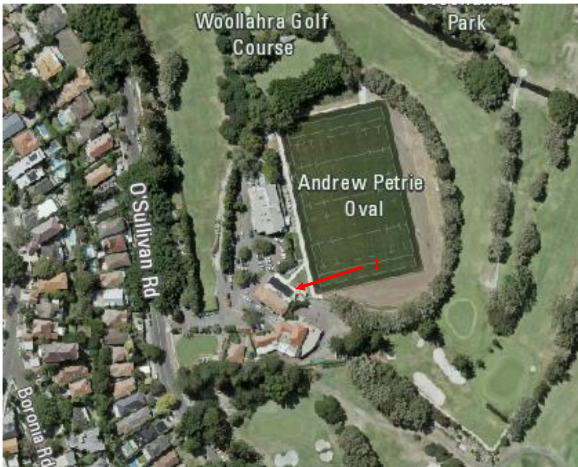
Figure 2: Location of building within Woollahra Park. Key: (1) George S. Grimley Pavilion (Woollahra Council GIS)