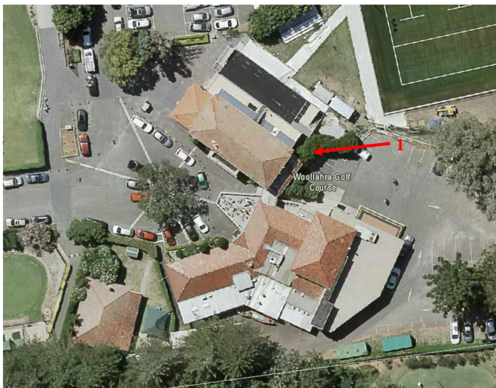
Figure 3: Aerial photograph over the site. Key: (1) George S. Grimley Pavilion (Woollahra Council GIS).